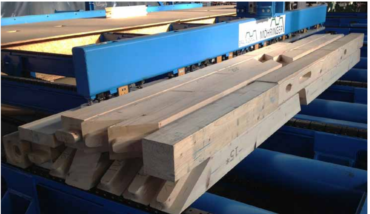
Stacking of timber for roof trusses

The objective for designing of our FLEXISTACK was the development of a technical solution to sort and stack sawn timber completely automatically. This automatic handling should effect considerable cost and material saving at the sawing process.