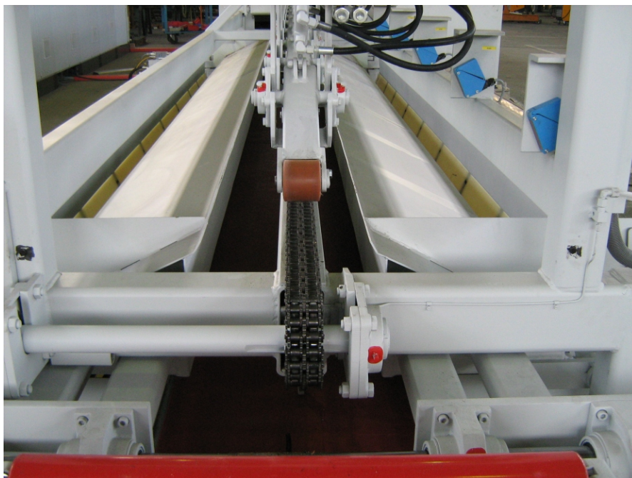
Edger outfeed with transport belt at the bottom side: 3 different qualities can be separated

The resawing line AUTOJET RIP is predestined for the cutting of hardwood: high flexibility, gentle timber manipulation, precise chain guiding for glue-able cuts and unique separation of chips!