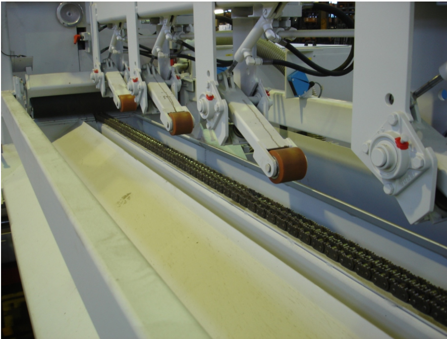
Edger outfeed with central chain and two movable separating lamellas