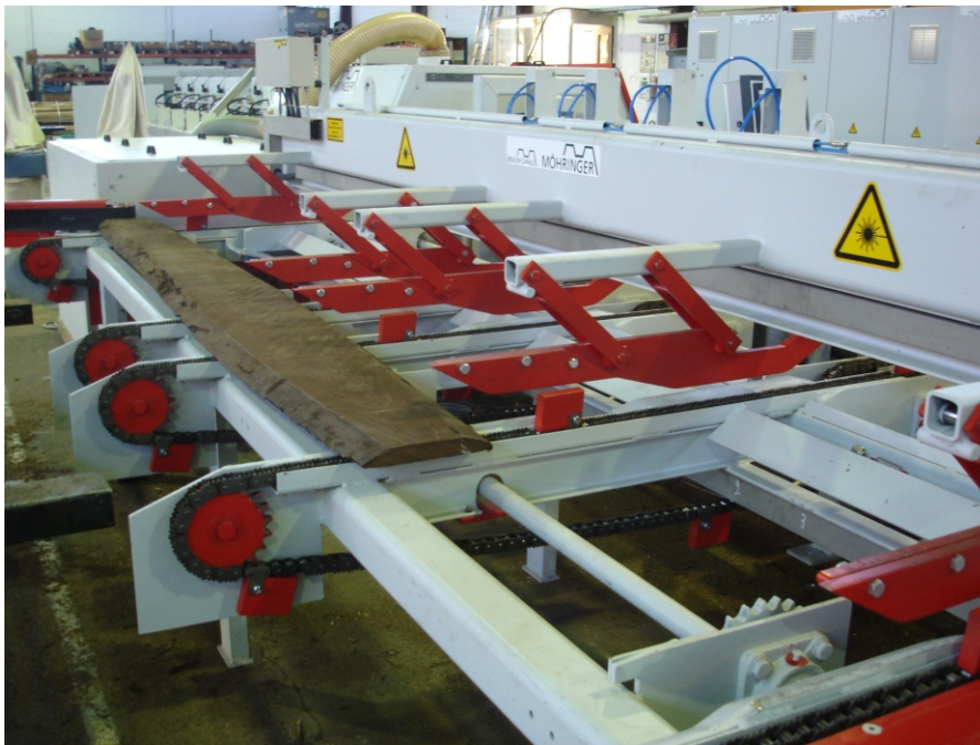
Cross feed and laser scanner