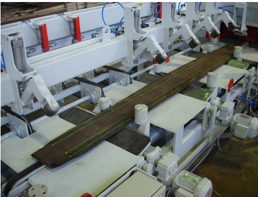
Positioning table with laser projector for controlling / change of the cutting lines

The resawing line AUTOJET RIP is predestined for the cutting of hardwood: high flexibility, gentle timber manipulation, precise chain guiding for glue-able cuts and unique separation of chips!